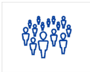
Growing the Walmart+ network from 2,000 to 14,000 sites

This offer will attract a large and growing digitally engaged consumer segment of Walmart+ members, who benefit from a 10¢/gallon everyday discount. Walmart+ members do not need to visit a Walmart store to access their fuel benefit (no earn and burn required). Walmart is also well-known for being a major player in ecommerce and a leader in grocery delivery.